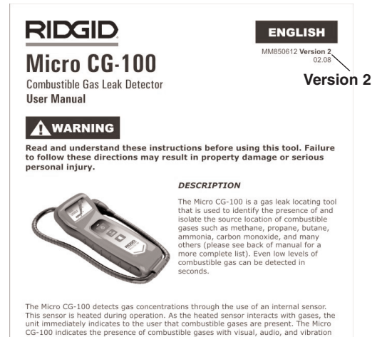
Correct User Manual