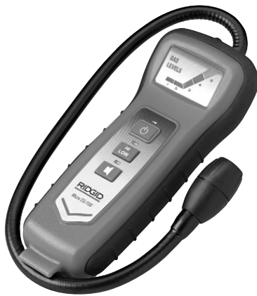
Micro CG-100 Combustible Gas Sniffer

SUBJECT: All RIDGID® Micro CG-100 Combustible Gas Sniffers (Catalog #26148) Produced before February, 2008: